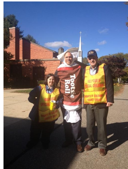
Knights of Columbus

Visit our website www.bedfordcatholic.org for information on our ministries and how to get involved in parish life!