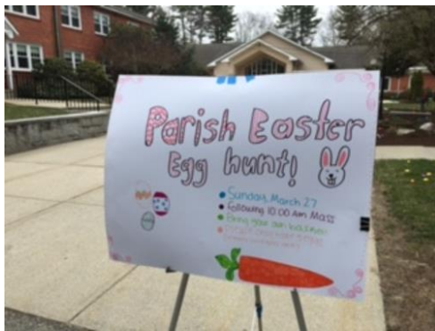
Parish Egg Hunt