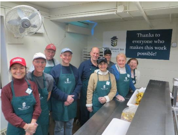
Pine Street Inn Ministry